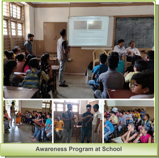
Awareness Program at School needed to be solved among 60+ students of G. & G. V. Kadiwala & M.V. Bunki Sarvajanik High School, Students also got knowledge about the species of animals, their Habitat and their role in Environment and mainly they can develop love for such animals.

NCSEERC volunteers celebrated World Earth Day by spreading awareness about Protect our species, snakes of India and other environmental issues that