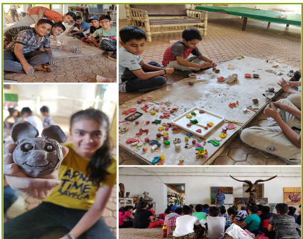
Saputara - Art & Craft Camp