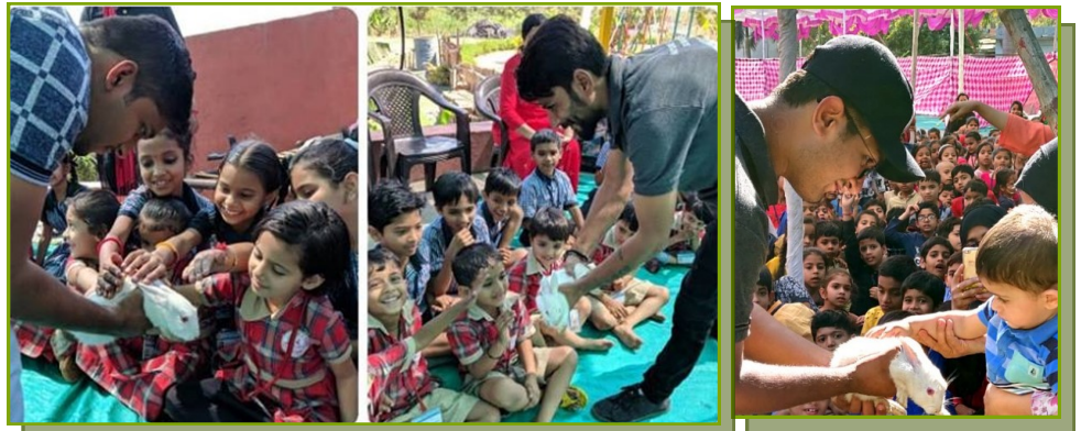
Glimpse of various Touch & Feel Program