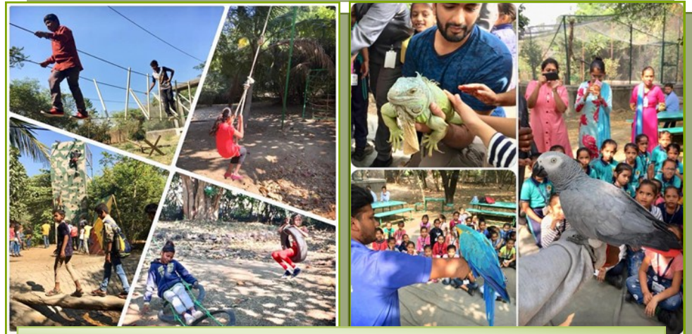
Eco Farm - Camp