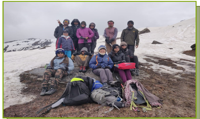
Manali Adventure Camp

This time we have only 11 participants in camp. But all are with all age group and much more enthusiastic. Other than trekking participants also enjoyed adventure activities such as River Rafting, Paragliding & rappelling. Duration was 10th May to 21st May 2019.