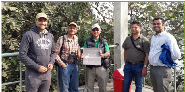
Photography Competition @Gavier