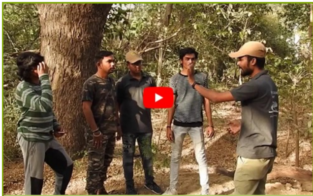
Short Film by NCS volunteers for Holi

NCS Volunteers had also prepared one Small Play on Eco Friendly Holi.