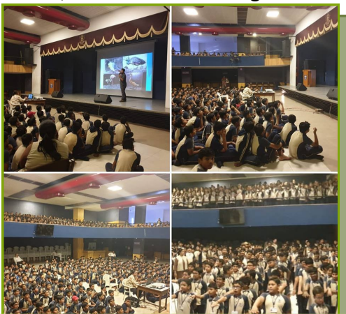
Awareness program during Kite flying festival @Sanskar Bharti School

Bird Rescue camp was organized during 12 th Jan to 20 th Jan 2019 for saving the injured bird because of thread of kites. Volunteers had work very hard to rescue number of birds from all over the Surat city. Before Uttarayan, NCS had organized awareness programs in different schools, colleges and other public places to make people aware and make them understand that how we can save Birds during this festival. One Skit was played at Mall by NCS volunteers with Auro University students to realize the citizens that, what are the feeling of birds during this festival.