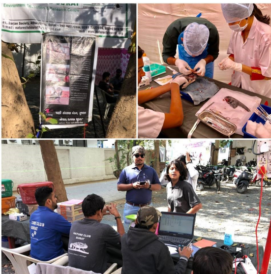
Rescue Centre during Kite flying festival