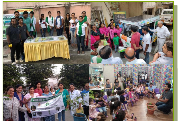
Environment Day Celebration