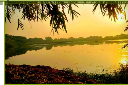
Gavier Photography Competition winners photos