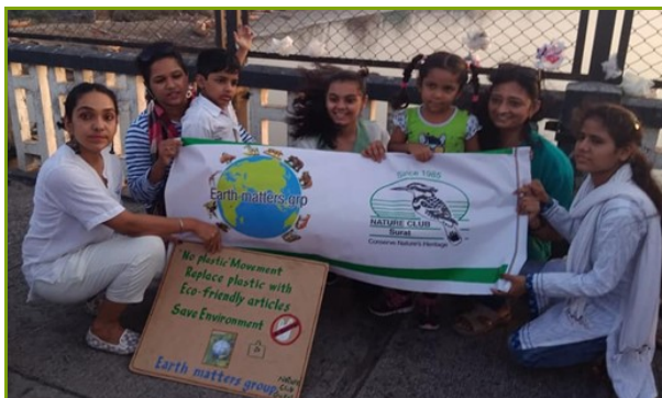
No Plastic awareness drive at ONGC bridge