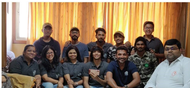
NCS volunteers team working for Holi awareness

We are thankful to all the personality who have given their views on Eco friendly Holi and help us to motivate citizens of Surat to come forward and go for this new environment friendly Holi. Special thanks to 11 society of