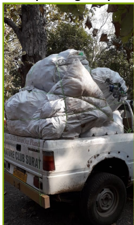
Garbage Collection from different sites

Special Thanks to volunteers Maharshi Patel & Jagdish Parmar For maximum help during this period.