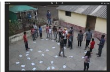
Saputara Camp : May 2018