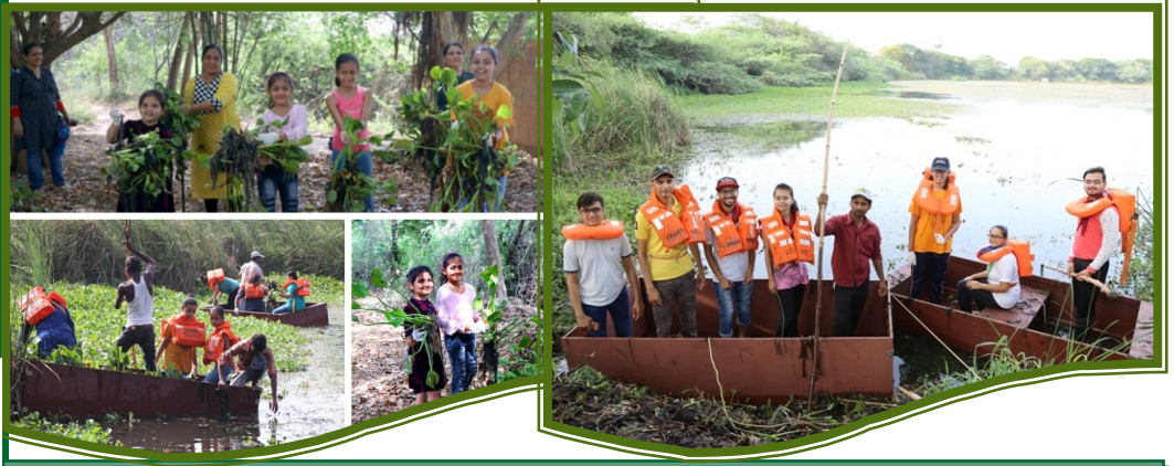
Gavier Lake Cleaning by Lady volunteers and SCET NSS Volunteers team