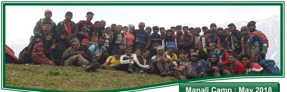
Manali Camp : May 2018