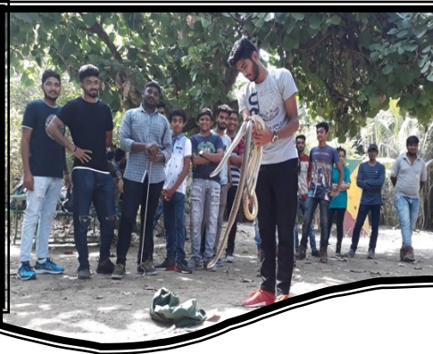
Snake Rescue Training