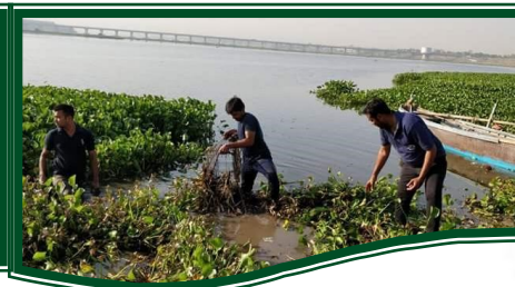
SAVE TAPI ABHIYAN

Thanks for showing your interest in mother earth!!... Come Join us for Noble Cause