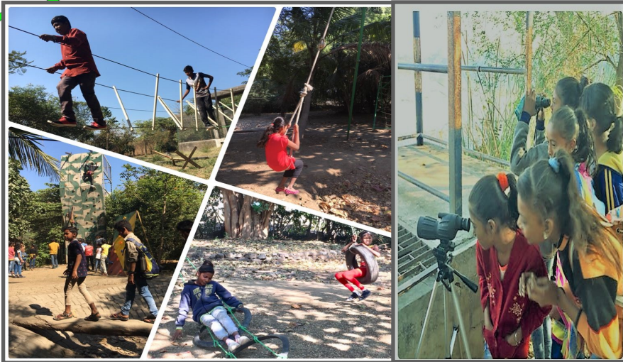
ECO Farm & Gavier Lake Visit